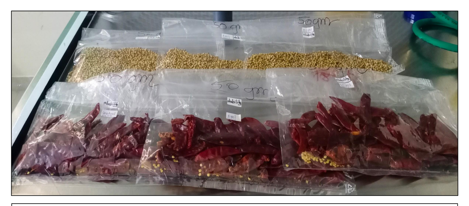
Image: Represents the 50 g of spice samples stored in plastic punches for trials. Control sample (on the left side) and two treated samples(middle and right side) with L44-F by spraying with certain concentration. After spraying L44-F the samples were allow to air dry before packing and then kept for further studies.