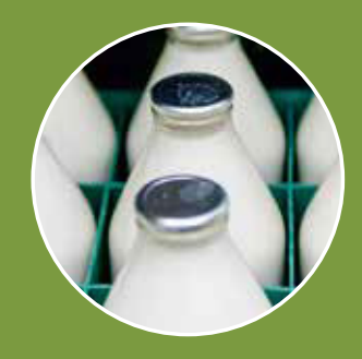
Can be used for cleaning of packaging containers like glass milk bottles, as it is food contact safe